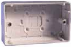
K2142 Double Gang Back Box