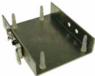
547.004.002 DIN Rail Mounting Bracket