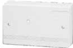
M520 MX Module Cover including PCB cover & screws.