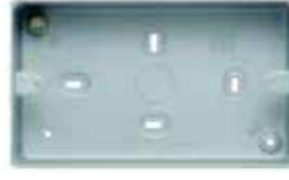
517.035.011 K2214 Aluminium Back Box