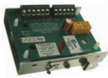
DIN Rail Mounting Bracket shown with RIM800 (not included).

The DIN Rail Mounting Bracket can be used to mount standard sized MX Ancillary Modules (61 x 84mm) onto a standard 35mm DIN Rail by simply clipping the PCB onto four pre-fitted plastic pillars. The MX1 Loop Card/Module Bracket provides an alternative module mounting facility for in-cabinet MX1 installations.